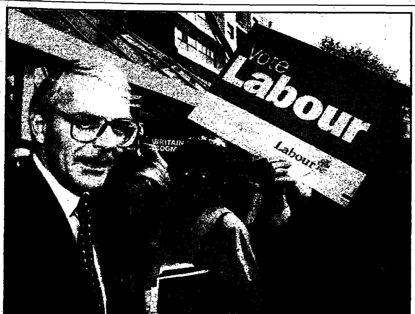
Labor supporters heckle Prime Minister John Major yesterday, as he makes his way through north London.